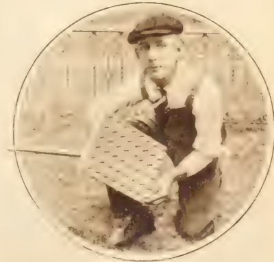
HENDERSON'S SOD PERFORATOR

An invaluable tool to aid in renovating bad spots in lawns, grass plots, putting greens, etc. It is operated like a rammer, the lower surface being provided with spikes which puncture the sod, leaving small holes into which much of the seed or fertilizer drops when broadcasted thus preventing its being blown or washed away. The holes are filled with soil by the first rain, which covers the seed so it can germinate. Price, $4.00.